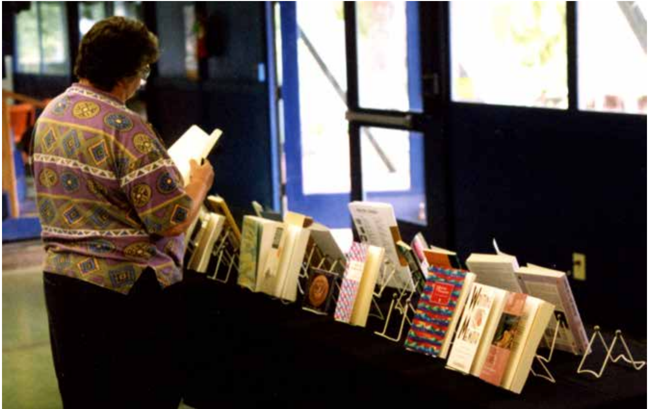
Browsing the book table, 1999