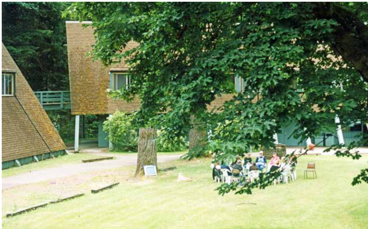
A class meeting on the lawn, 1999