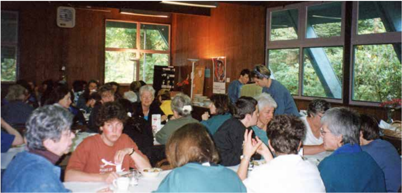
Dining room scene, 1999