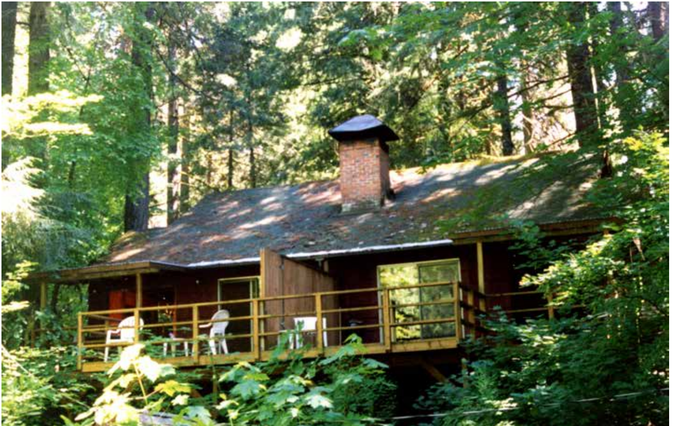
The "duplex" cabins at Cedarwood Lodge, 1999