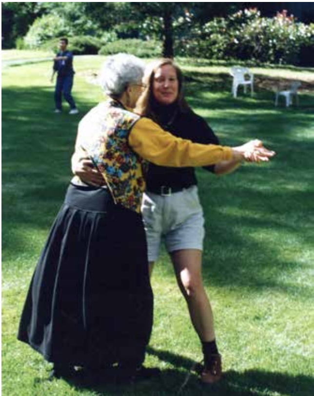
Dancing on the lawn during solstice celebration, 1999