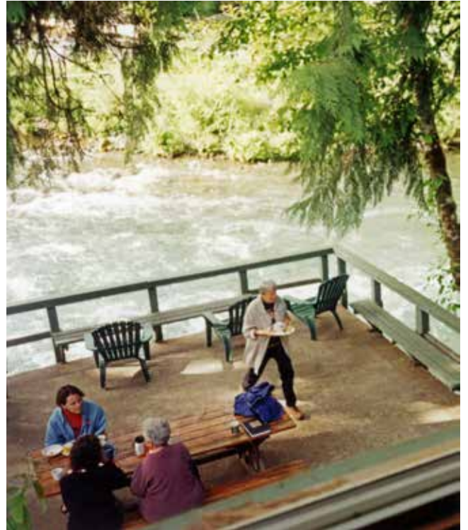
Terrace scene with Ursula K. Le Guin, 1999