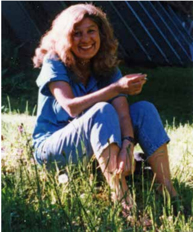
Mimi Khalvati, 1999