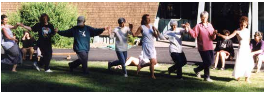
Dancing on the lawn, midsummer celebration, 1999