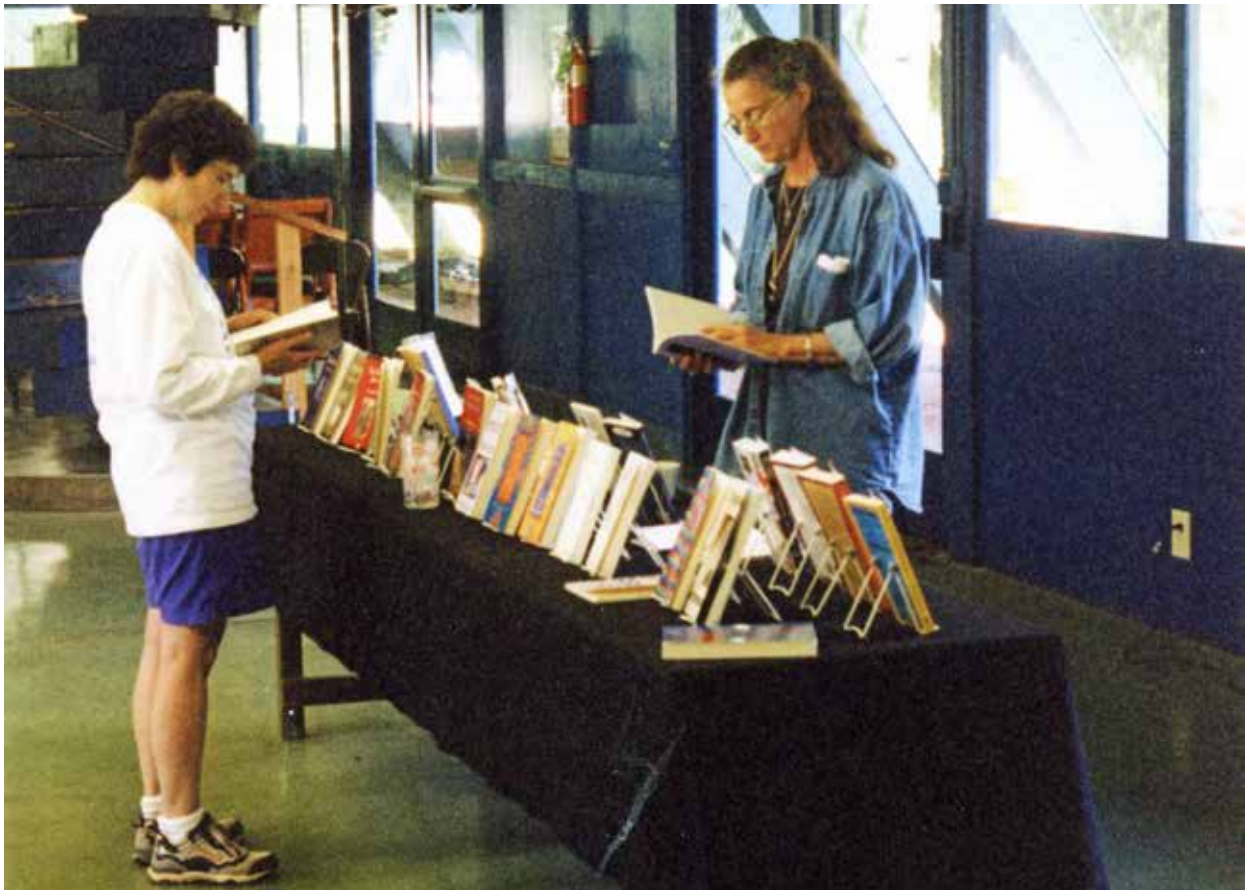
Browsing the book table, 1999