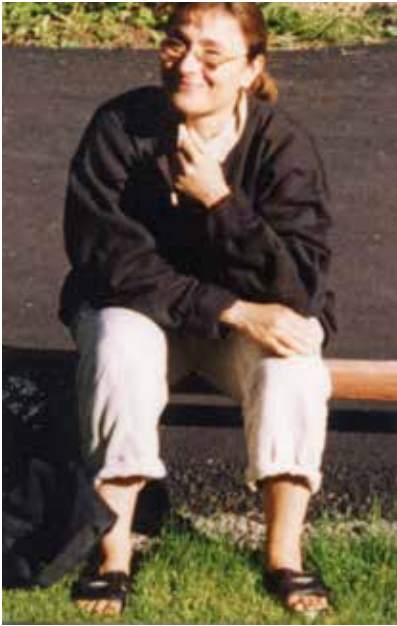
Olga Broumas, 1999